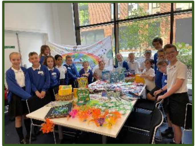
Earth Heroes/Global Leaders Conference - Liverpool