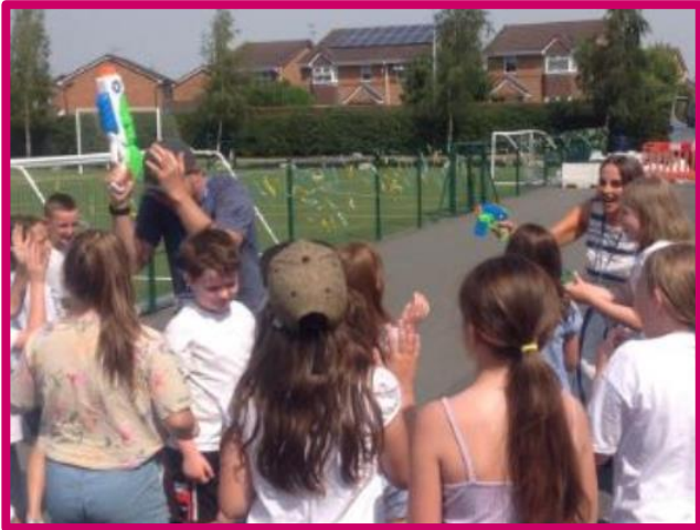
YEAR 4 COOLING DOWN WITH WATER GAMES

We survived the two days of intense heat. Measures were put on place to keep classrooms cool and ventilated. The children had access to water and were encouraged to keep hydrated. Break times were restricted to 5 minute bursts outside in the shade. Everyone stayed well in school, but we are pleased that it is slightly cooler now.