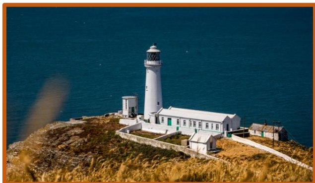
South Stack Lighthouse - Anglesey