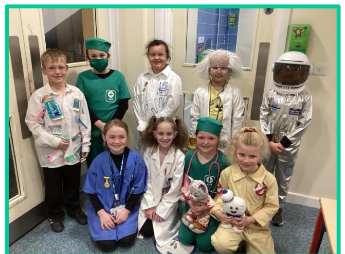
We've had some super scientists in school today, thanks to all the children and parents for getting involved.