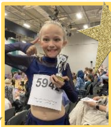
Summer Yr5/CP DANCE